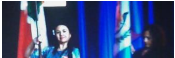
The Flags of all the countries of Delta Kappa Gamma were on the stage throughout the convention. At the closing ceremonies the flags were carried out in a recessional. An impressive ceremony. *