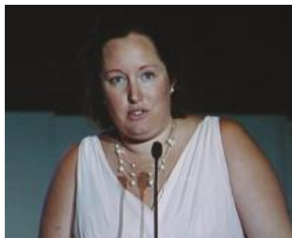
Very impressive, insightful, and inspiring speeches from a young "DKG Next" member at each gathering throughout the convention stole the show!! These key women educators of the younger generation give promise of a strong and bright DKG future. *